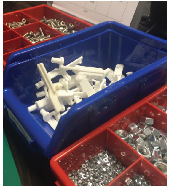
Selective Laser Sintered nylon spare parts